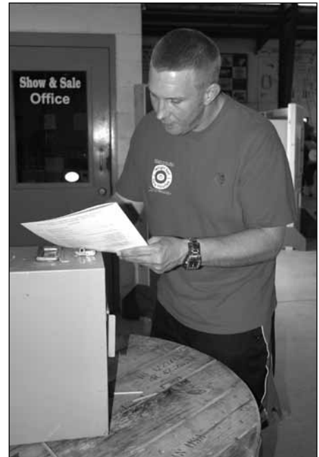
A member-elected board of directors is one of the founding principles of electric cooperatives. Exercising that voting privilege is a key facet to annual meeting each year.

Though we didn't talk in depth about it this year, please keep in mind