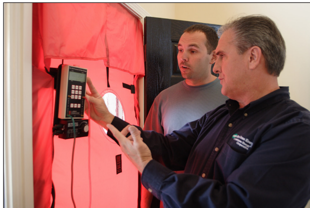
A blower door test is the best way to find a home's air leaks and a critical part of evaluating a home's overall energy efficiency.

For other tips on how to save energy -- and money -- visit the energy-saving web site, www.TogetherWeSave.com or call the energy efficiency experts at Boone Electric Cooperative at (573) 449-4181.